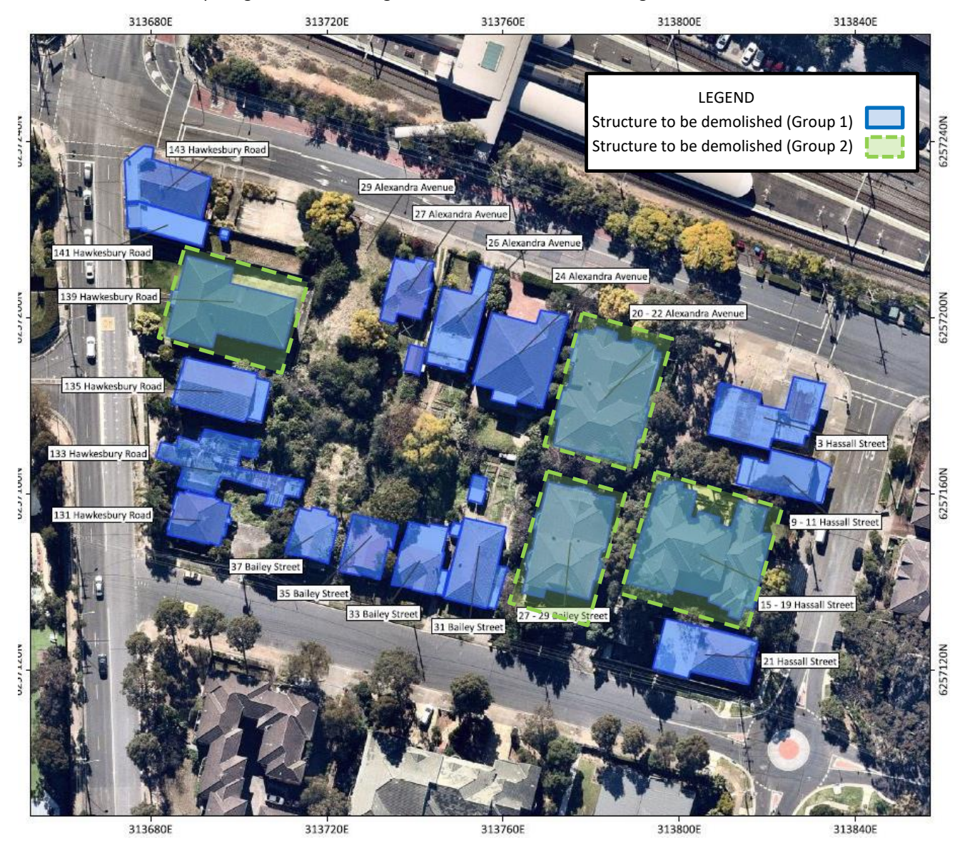
Figure 2: Westmead Site Map

The Westmead site is located on the eastern side of Hawkesbury Road, south of the existing Westmead station. The site is bounded by Alexandra Avenue, Hawkesbury Road, and Bailey and Hassall Streets. Works on the site involve demolition of a number of low-rise residences and local business premises. The site will be used for the Westmead Metro Station. Structures to be demolished are highlighted in Figure 2. Note that the structures identified with a green outline are multilevel structures requiring some hammering of concrete columns and footings.