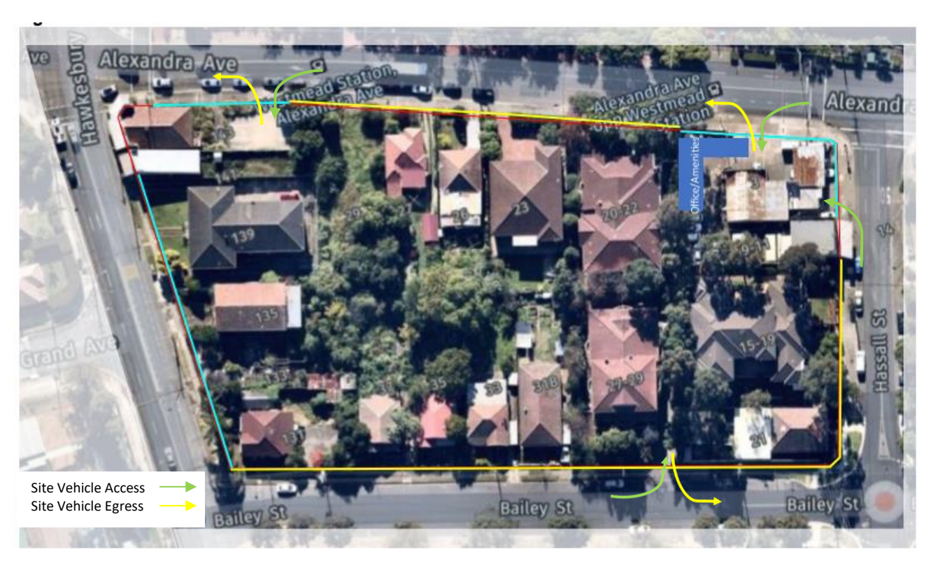
Figure 3: Westmead Site Layout and Access

Page 7 of 30 STOP-THINK-ACT Print Date: 2/11/2021 7:29 AM