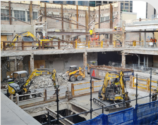
MARKET STREET SCENTRE GROUP | SYDNEY, NSW

3,000t hard/soft strip out. Demolition of existing 15 storey structure. Install 550t of structural steel to retain heritage facade. Asbestos, Lead Dust and Lead Paint remediation. Heritage/asset salvage and protection. Decommissioning/removal of 16 escalators and 8 lifts. Accelerated programme and demolition for tower crane, alimaks, driveway entrance and construction decks. Excavation of 1800m 3 of pads, strips, overruns, crane and alimak bases. Traffic management. >95% C&D waste recycled.