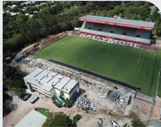
BALLYMORE STADIUM BMD GROUP | BRISBANE, QLD

3,000t hard/soft strip out. Demolition of existing 15 storey structure. Install 550t of structural steel to retain heritage facade. Asbestos, Lead Dust and Lead Paint remediation. Heritage/asset salvage and protection. Decommissioning/removal of 16 escalators and 8 lifts. Accelerated programme and demolition for tower crane, alimaks, driveway entrance and construction decks. Excavation of 1800m 3 of pads, strips, overruns, crane and alimak bases. Traffic management. >95% C&D waste recycled.