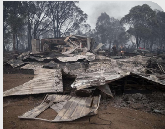
NSW BUSHFIRE DISASTER RESPONSE NSW GOVERNMENT | SOUTH COAST, NSW

Demolition and load out of 290 fire damaged properties, with sites and crews up to 200km apart. Asbestos removal and disposal. High level stakeholder (community) engagement. Cultural & Heritage protection works.