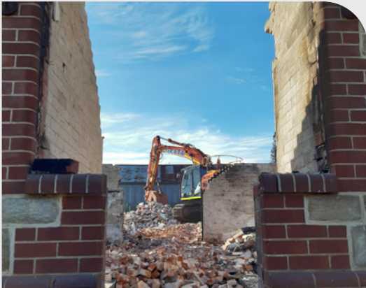
SA BUSHFIRE DISASTER RESPONSE SA GOVERNMENT | ADELAIDE HILLS & KANGAROO ISLAND, SA

Structural demolition of the 3,000 seat McLean Stand and Northern Stand. Live operational environment: ongoing training commitments of the Queensland Reds rugby franchise. Asset protection and salvage (for new build construction). Services termination. Removal of footings. Protection of all elements not associated with the demolition line. Asbestos removal, including contaminated soil. >95% C&D waste recycled.