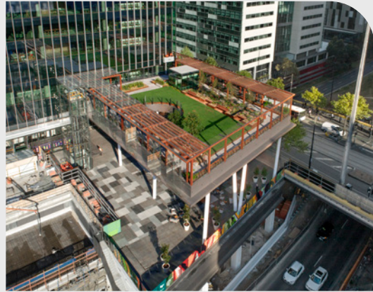
MELBOURNE QUARTER SKYPARK LENDLEASE | MELBOURNE, VIC

Demolition and removal of existing roadway and pavements. Kerbs and channel installation. Installation of heavy duty asphalt for Aurora Lane. Supply and installation of bluestone and granite pavements. Horticulture design and installation - grass, trees and shrubs. Installation of irrigation system. Outdoor furniture and fittings.