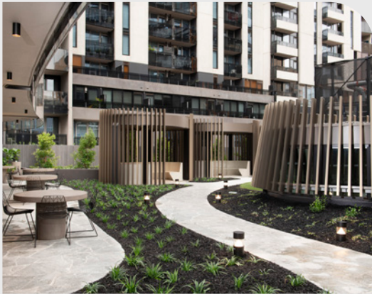
CAPITOL GRAND MULTIPLEX | MELBOURNE, VIC

Demolition and removal of existing roadway and pavements. Kerbs and channel installation. Installation of heavy duty asphalt for Aurora Lane. Supply and installation of bluestone and granite pavements. Horticulture design and installation - grass, trees and shrubs. Installation of irrigation system. Outdoor furniture and fittings.