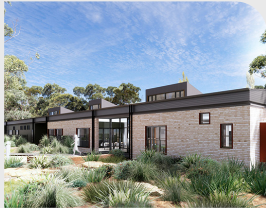
VICTORIAN SCHOOLS PROJECT ADCO | MELBOURNE, VIC

Demolition and removal of existing roadway, kerbs, pavements. Installation of kerbs, drainage and heavy duty asphalt. Supply and installation of landscaping as well as outdoor furniture, fittings, including precast seating and BBQs. DNC irrigation. Reclaimed timber cladding and decking.