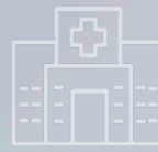
HEALTH & AGED CARE