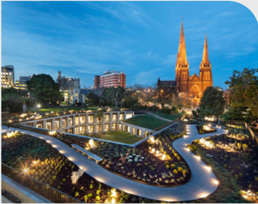
VICTORIAN PARLIAMENT HOUSE COCKRAM CONSTRUCTION | MELBOURNE, VIC

Excavation of existing materials. Installation of rooftop garden. Pavement construction, including retaining walls. Design and construct irrigation system. Laneway stormwater and asphalt installation. Horticultural design and installation: >20,000 individual plants/trees. Turf (grass) laying. Cranage of feature (mature) palm tree.